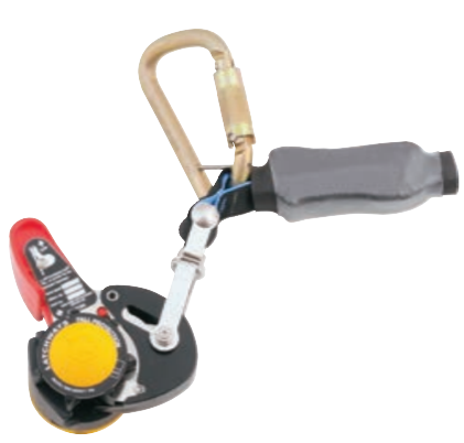
TowerLatch systems for overhead towers use the TowerLatch or TowerLatch SP attachment devices.